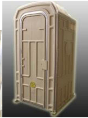
SJSDCS 520 Comfort Station